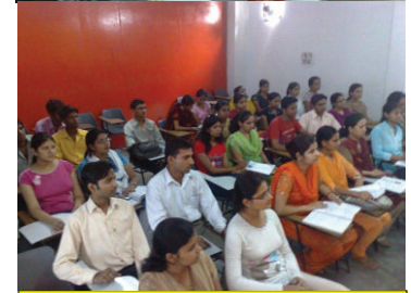
PTU students working in Computer Lab and attending lecture in the class room in a Learning Centre at Meerut.