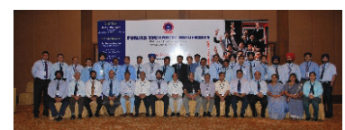
Regional Heads with PTU Officials at National Conference in 2009 at Goa

Mere submission of an application does not mean that you will be allotted the center. Any applicant should not indulge in any activity that highlights them to be a learning center TILL they get an allotment letter duly signed from the University.