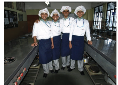
PTU Hotel Management Students during a session in the Kitchen of Learning Centre at Lucknow

Fill the form correctly and attach all relevant documents asked in the form.