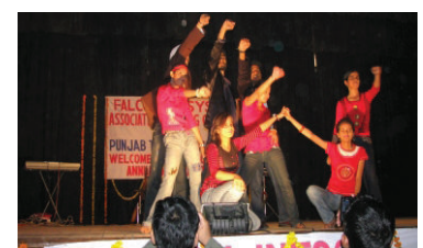
PTU students of BCA performing dance in the Annual Function at Lucknow