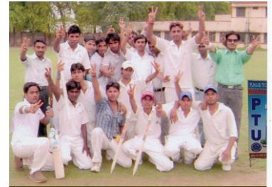
PTU students after winning a friendly match at Allahabad (LC Name: NIPS)