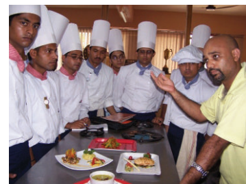
Students Learning Tips in Nouvelle Cuisine Workshop 2 At LC in Lucknow