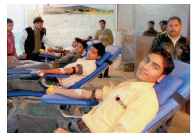
PTU students of Allahabad Learning Centre, NIPS donating blood at Govt. Hospital, Allahabad.

USE ONLY PRESCRIBED FORM OF THE CURRENT YEAR