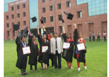
Happy students of U.P. & Uttarakhand swirling their caps in the air after the 8th convocation gets over at PTU Main Campus, Kapurthala Road.