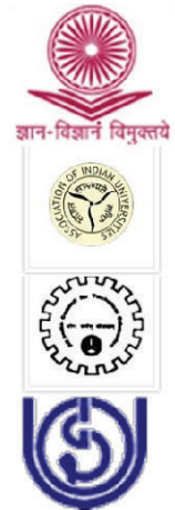
RECOGNISED BY JOINT-COMMITTEE OF UGC-AICTE-DEC (IGNOU)