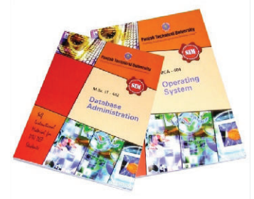
SIM Books of PTU Distance Education Program