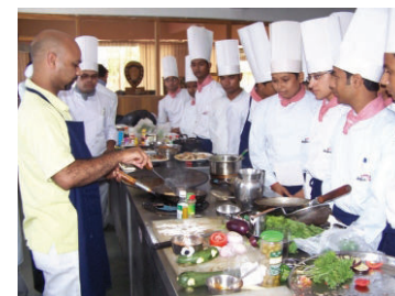
Students Learning Tips in Nouvelle Cuisine Workshop 1. At LC in Lucknow

Diplomas awarded by Universities/recognized boards shall only be considered for Lateral Entry.