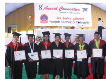
Students from U.P., Uttarakhand, M.P., Chattisgarh before the convocation stage after the convocation gets over.