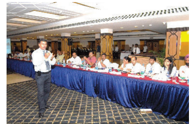
New LC Induction Programme of IT & Management at Piccadilly Lucknow