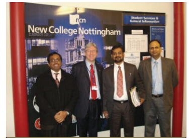
PTU team at International Conference on Distance Education in Delhi & at New College Nottingham

allocated specific geographical zones exclusively to respective Regional Centres through a process. The regional centre is responsible for various services to the Learning Centres following under the said zone.