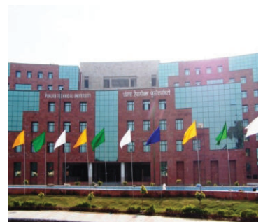
PTU's Self Financed Campus established in 75 ares of land at Kapoorthala near Pushpa Gujral Science City.