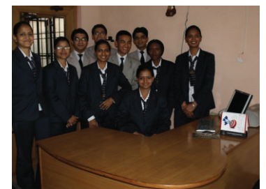
PTU Hotel Management Students during a session on the Front Desk of Learning Centre at Lucknow