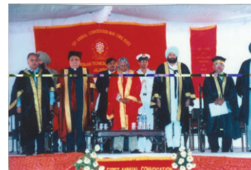
His Excellency Dr. A. P. J. Kalam with Governor & Chief Minister in 1st Convocation